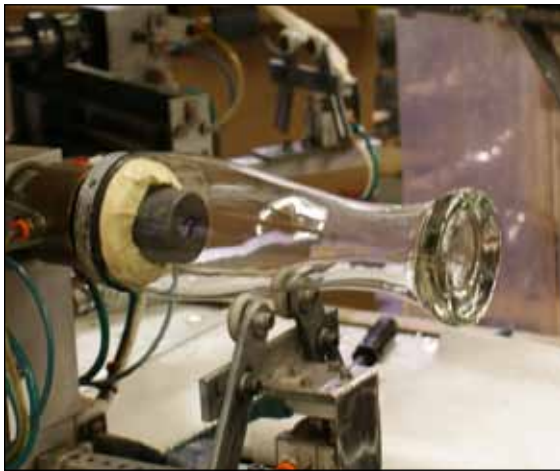
Cardinal's precision equipment is meticulously calibrated to ensure quality output on every production run.