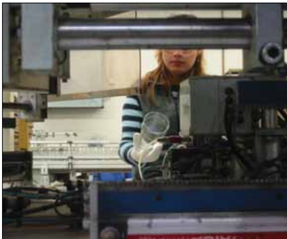
Every piece is inspected for quality.