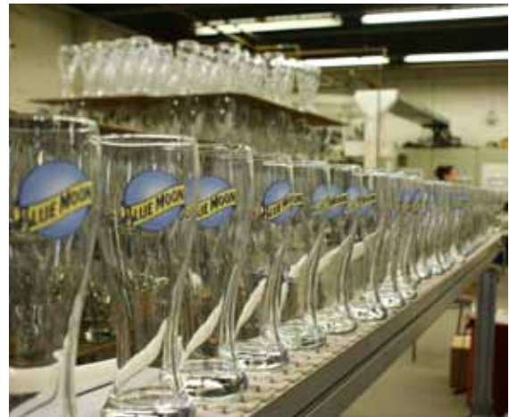
We are equipped to mass produce large orders with our fully automated machines. Glasses ride along the belt to be automatically loaded into the oven for firing.