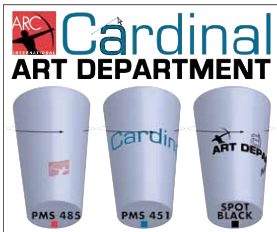
Artwork is separated into individual colors by our artists in preparation for being printed onto your glass

To find out how simple and easy the process can be, contact your Cardinal representative or send an email to: cardinalsales@arc-intl.com .