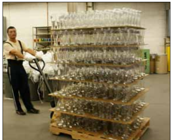
Glassware is delivered to the decorating machines.